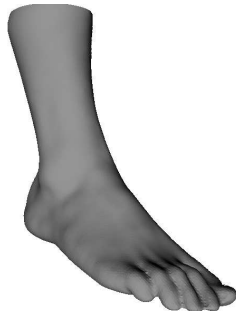
Fig. 1. Foot original model.

The 3D model used for demonstrating the results is the Foot with 25845 vertices and 51690 triangles. The original model can be seen in Figure 1 whereas the watermarked model with t = 1.4 and b = 0.6 is depicted in Figure 2. The model has been watermarked using 1000 random keys and then simplified with various mesh simplification factors that range from 15% to 50%. Detection has been performed using the 1000 correct and 1000 wrong keys. The corresponding ROC curves are depicted in Figure 3.