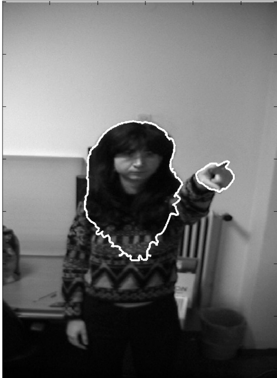
Figure 3: Pointing hand and head detected by the GVF snake in a frame acquired in the frontal camera setup.