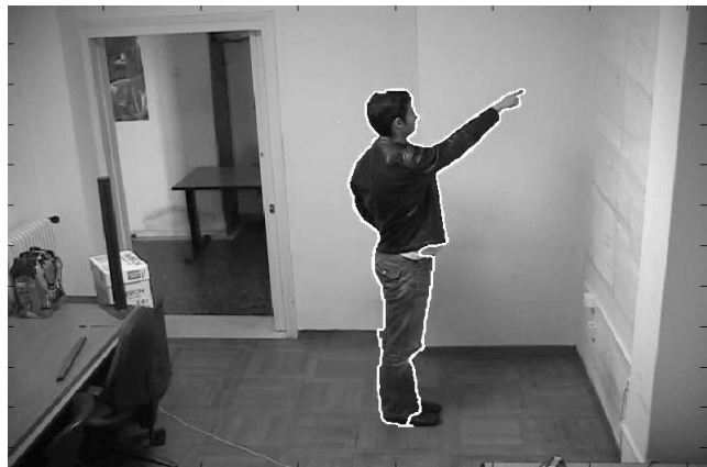
Figure 2: Silhouette detected by the GVF snake in a frame acquired in the side camera setup.

In the frontal camera setup, we use only 2 points for creating a feature vector. These points are the top of head ( \mathbf{x}_h ), and the hand ( \mathbf{x}_{hd} ). Two snakes were applied in the first frame of the video sequence in this case: The first one in order to roughly localize the head and the second one to localize the pointing hand. For the initialization of the first snake, we use an ellipse centered in the center of the frame, whereas for the initialization of the second snake a circle is used. The user is asked to point at a predefined cell at the start of the session and the circle is centered at the area where the hand resides in such pointing gesture. The top of head ( \mathbf{x}_h ) is obtained from the first snake as the point with the smallest y image coordinate. The center of gravity of the second snake