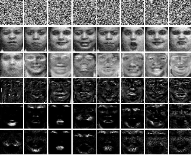
Fig. 1. Formation of several basis images through the proposed and random initialization.

negative. The parameter \lambda \geq 0 from step 7) d is selected such that the resulting \mathbf{z}_k^* satisfies the L_2 norm constraint. This is done by solving a quadratic equation [4].