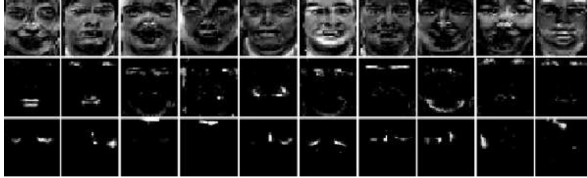
Figure 1: A set of 10 basis images learned by NMF (top), DNMF (middle) and LNMF (bottom).

numbers of basis images. The image data are then projected into the image basis in an approach similar to the one used in PCA, yielding a new feature vector \mathbf{F} = \mathbf{Z}^T(\mathbf{X} - \Psi) , where \Psi is a matrix whose columns represent the average face \psi = \frac{1}{n} \sum_{j=1}^n \mathbf{X}_j . In the test phase, for each test face image \mathbf{x}_{test} , a new test feature vector \mathbf{f}_{test} is then formed as \mathbf{f}_{test} = \mathbf{Z}^T(\mathbf{x}_{test} - \psi) .