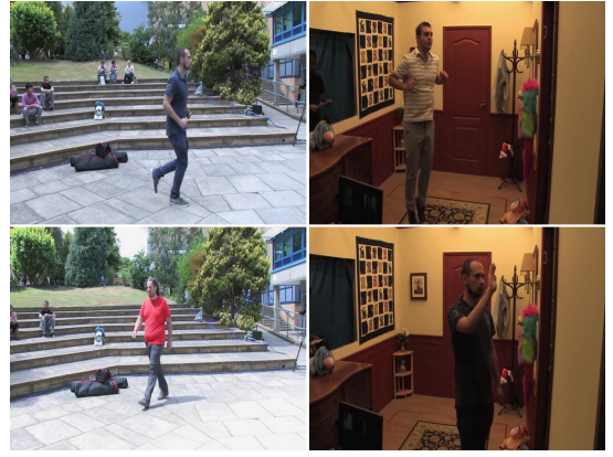
Fig. 1. Example frames from the IMPART video dataset. The respective activities are "Run" (top left), "Walk" (bottom left), "Jump" (top right) and "Hand-wave" (bottom right).

Thus each script was executed three times per actor. Three main actions were performed, namely "Walk", "Hand-wave" and "Run", while additional distractor actions were also included and jointly categorized as "Other" (e.g., "Jump Up-Down", "Jump Forward",