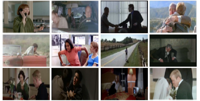
Fig. 4. Video frames of the Hollywood2 action database.

The Hollywood2 action database consists of 1707 action videos depicting actions collected from 69 different Hollywood movies [10]. The actions appearing in the database are: 'answering the phone', 'driving car', 'eating', 'fighting', 'getting out of the car', 'hand shaking', 'hugging', 'kissing', 'running', 'sitting down', 'sitting up' and 'standing up'. The most widely adopted experimental setting on this data set is based on a split (823 training and 884 test action videos)