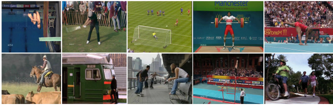
Fig. 3. Video frames of the UCF sports action database.

setting on this data set is based on a split (16 training and 9 test persons) that has been used in [11].